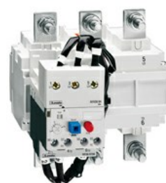
RF420 Motor protection relay