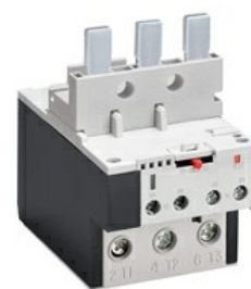
RFA110 Motor protection relay