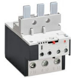
RFA82 Motor protection relay