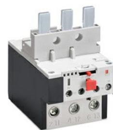
RF82 Motor protection relay