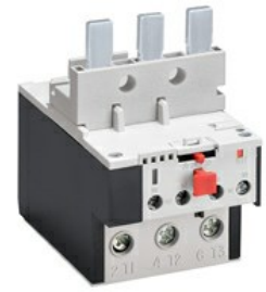
RF82 Motor protection relay