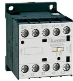
auxiliary contactor BG00