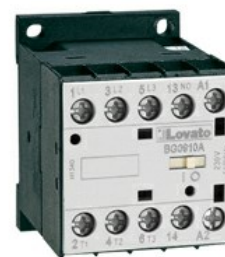
Power contactor BG06