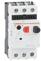
Motor protective circuit breaker SM1P